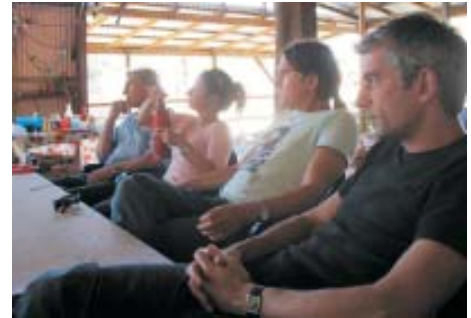
Friends from the Twin Creeks community join us at a Landcare meeting.