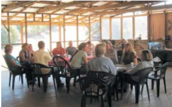
Working out our planting strategy with friends from the Bangalow and Possum Creek Landcare groups.