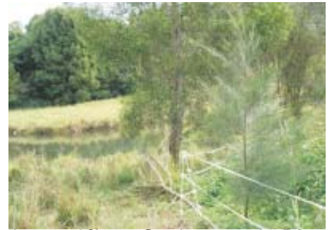
A view of Sleepy Creek next to the R1 planting. We use electric fencing to protect trees from grazing cattle.