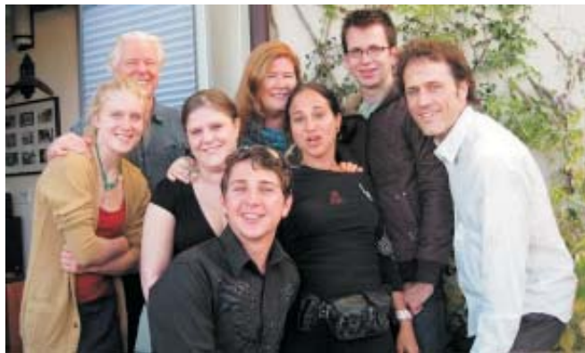
The September 'Spawn of Jindibah' get-together in New York: Jindi parents and kids.

M u l t i p l e Occupancy to Community Title. We have negotiated and liaised with 3 sets of Byron Councillors, 3 Mayors