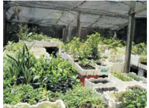
The excellent Ragged Blossom Nursery in Bangalow, our source of native seedlings.