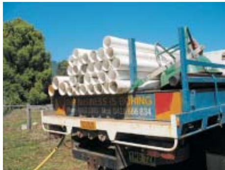
The "Boring" business hard at it.

With water a consideration in an era of changing weather conditions, we had two sets of water diviners assess our prospects for a bore, then, after obtaining the appropriate licence, called in the boys from Griggs 'Our Business is Boring' , to drill the bore within our cattle yards. A successful job, they discovered water at precisely the predicted spot.