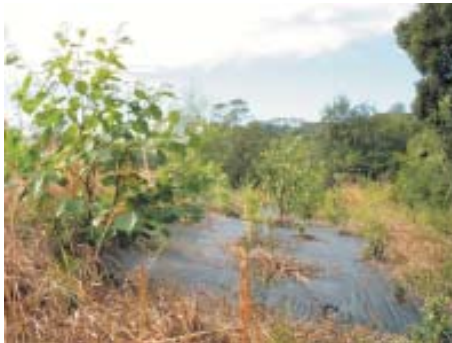
We have proved that weed matting really helps new plants get established fast.