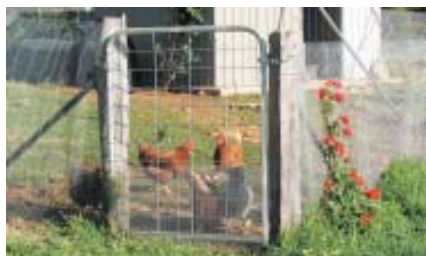
'Waste=food'. Thanks, chooks.

As well, a resurrection of the Possum Creek Landcare Group (Jindibah community are members) has met with the Bangalow Landcare Group , who have agreed to mentor our planting programs. We make sure there's time for social interaction, which makes the work part more fun.