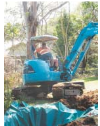
Rolly on the job.

With water a consideration in an era of changing weather conditions, we had two sets of water diviners assess our prospects for a bore, then, after obtaining the appropriate licence, called in the boys from Griggs 'Our Business is Boring' , to drill the bore within our cattle yards. A successful job, they discovered water at precisely the predicted spot.