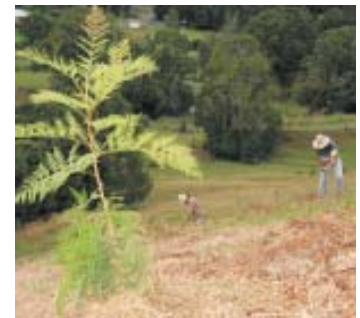
A Silky Oak is planted - with 1,199 friends, on our R5 slope.