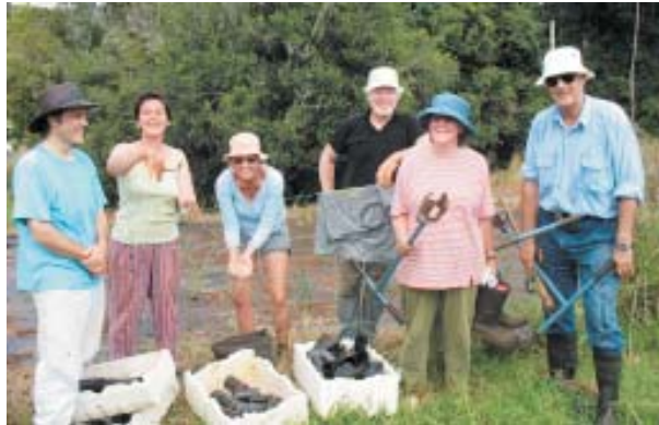
A working bee in April.

So as this 'decade of uncertainty' comes to a close, at Jindibah, we are methodically working through Council's 36 Consent Conditions to complete our conversion process.